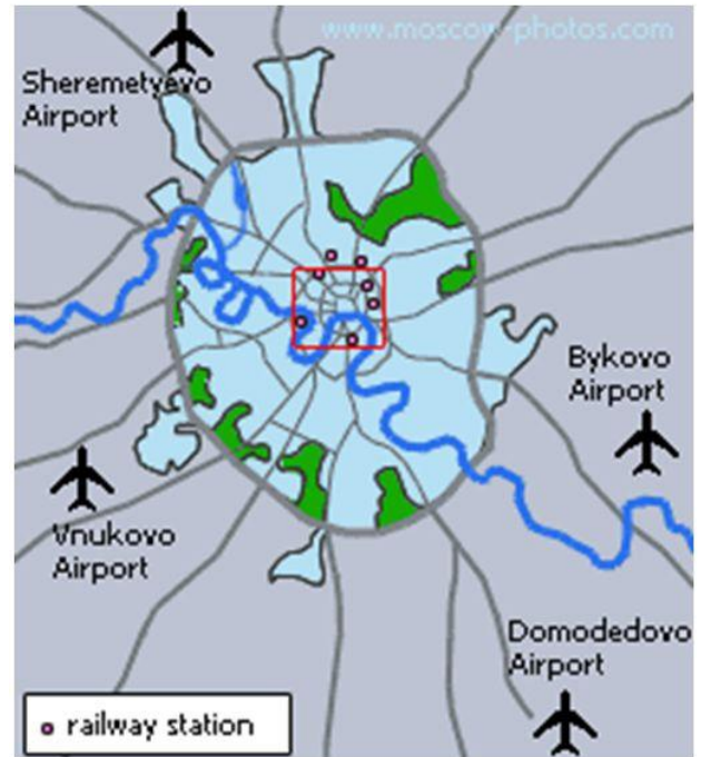
Fig. 2. Moscow airports

Important: please be aware that most probably, to travel to Moscow, you will need to obtain visa issued in the Russian embassy or consulate in your country. Please, refer the Visa info section in the conference website.