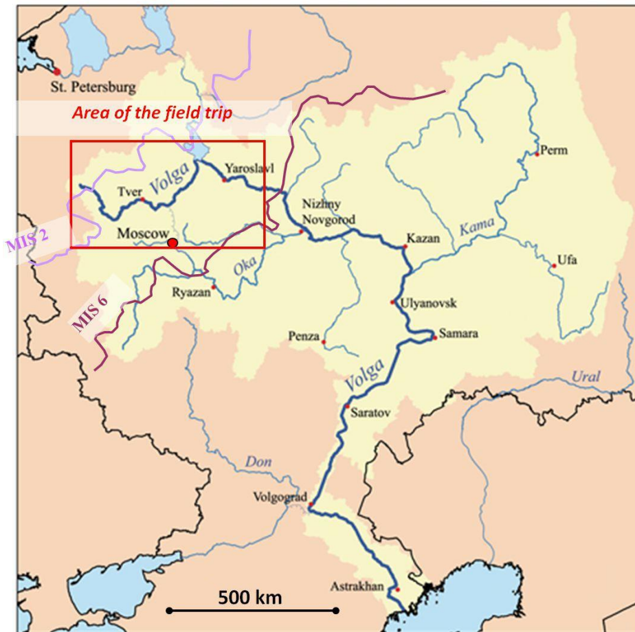
Fig. 3. River Volga drainage basin