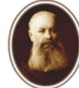
Dokuchaev Soil Science Society in Russia Commission on Paleopedology and Subcommittee on Micromorphology