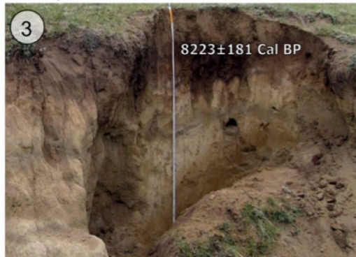
Chuya valley, between Kuraj and Chuya basins, Kuyaktanar influx, 1730 m a.s.l.