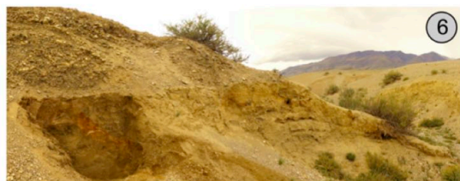
Redeposited Neogene sediments with Pleistocene pedogenic features at the foot of Kuray ridge in the Chuya basin, 1780 a.s.l.