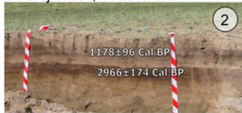
Chuya valley, between Kuraj and Chuya basins, Kuyaktanar influx, 1730 m a.s.l.