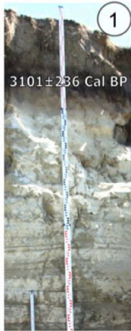
Old cannel of Chuya River, 1465 m a.s.l.