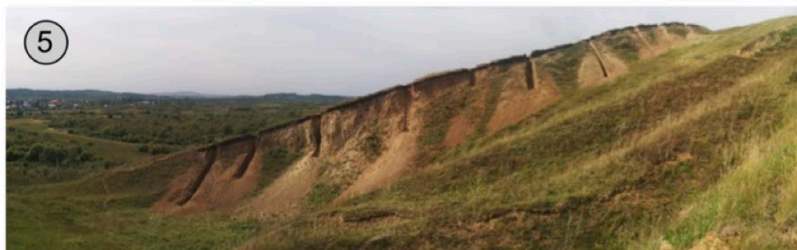
Loess-Paleosol Sequence at the Krasnogorskoye Section, the Low-Hill Zone of the Northeastern Altai Mountains, 300 m a.s.l.